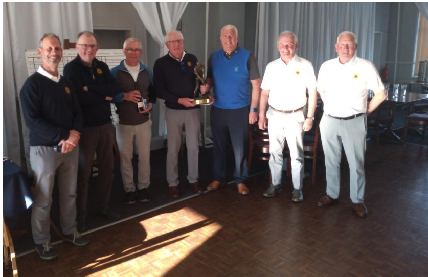
Keith Garner Trophy prize winners