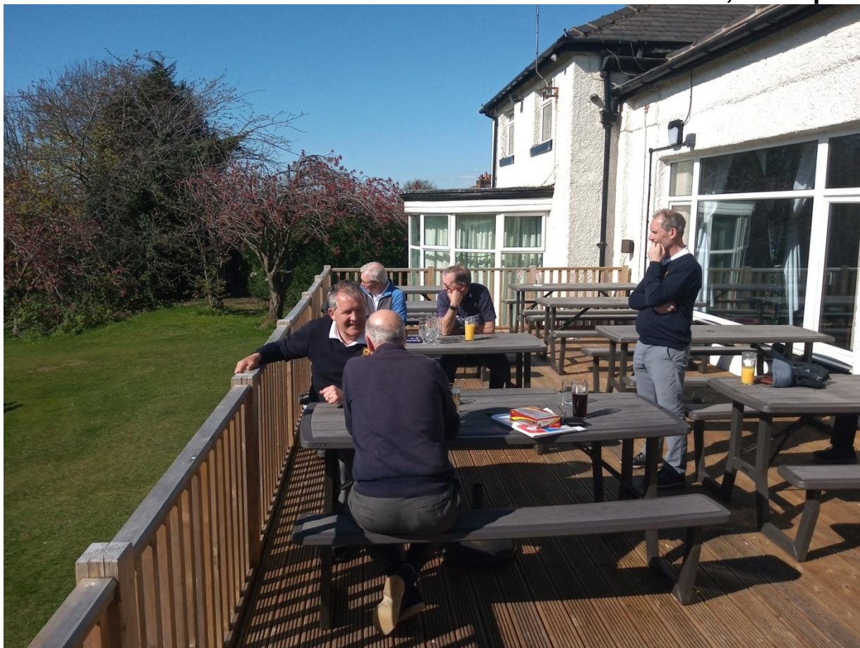
What LSS is all about as players enjoy the camaraderie and catch up after the match on Stand GC's new decking overlooking the 18 th green